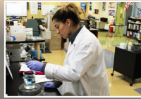
Medical Laboratory Assisting and Phlebotomy