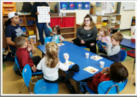
Child and Family Development