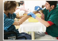
Nurse Assisting and Associated Health Careers