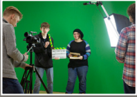
Digital and Visual Communication