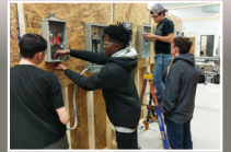
Residential and Commercial Electrical