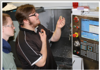
Engineering and Metal Fabrication - Machining