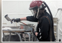
Auto Body and Collision Repair Technology