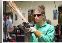
Engineering and Metal Fabrication - Welding