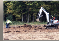
Heavy Equipment Operation and Maintenance